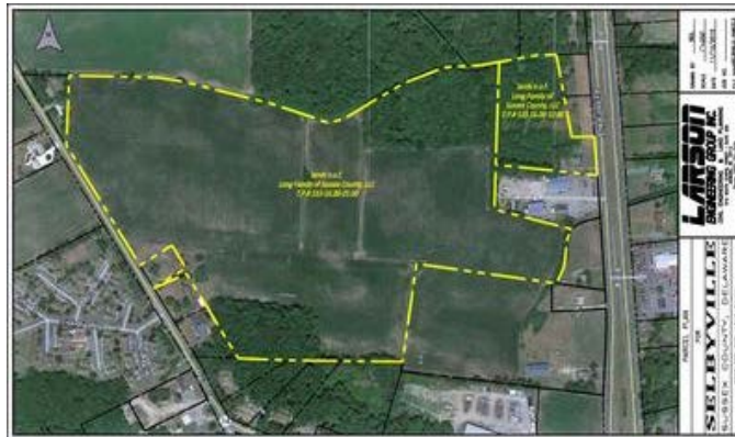
LONG FAMILY SELBYVILLE PROPERTY Next > AERIAL VIEW